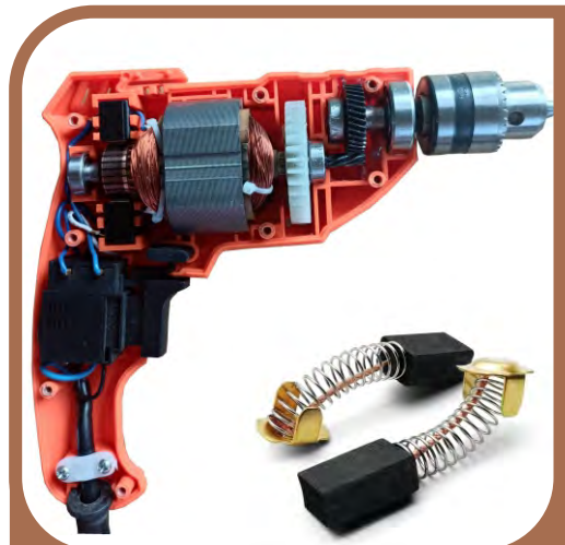
Power Tools - Spares