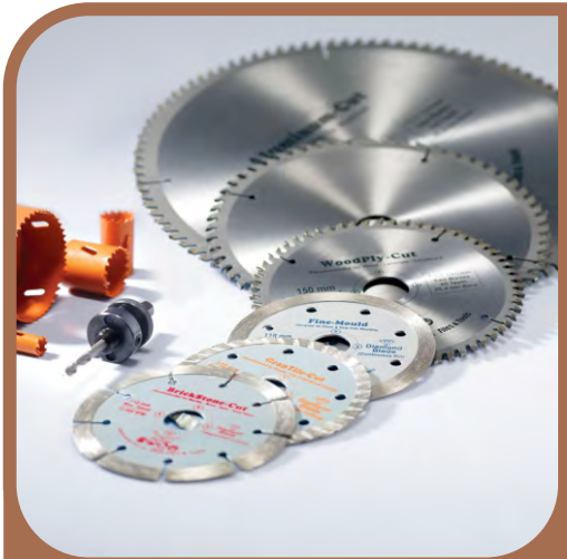
Power Tools Accessories