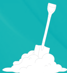
Removing Dirt or Debris